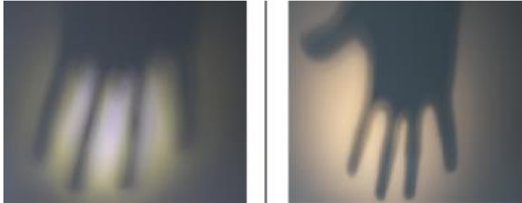
Spotlight on the market